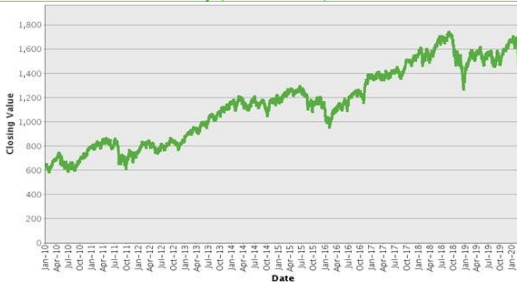
Russell 2000® Index – Historical Closing Values January 4, 2010 to March 17, 2020

The graph below shows the closing value of the Russell 2000® Index for each day such value was available from January 4, 2010 to March 17, 2020. We obtained the closing values from Bloomberg L.P., without independent verification. You should not take historical closing values as an indication of future performance.