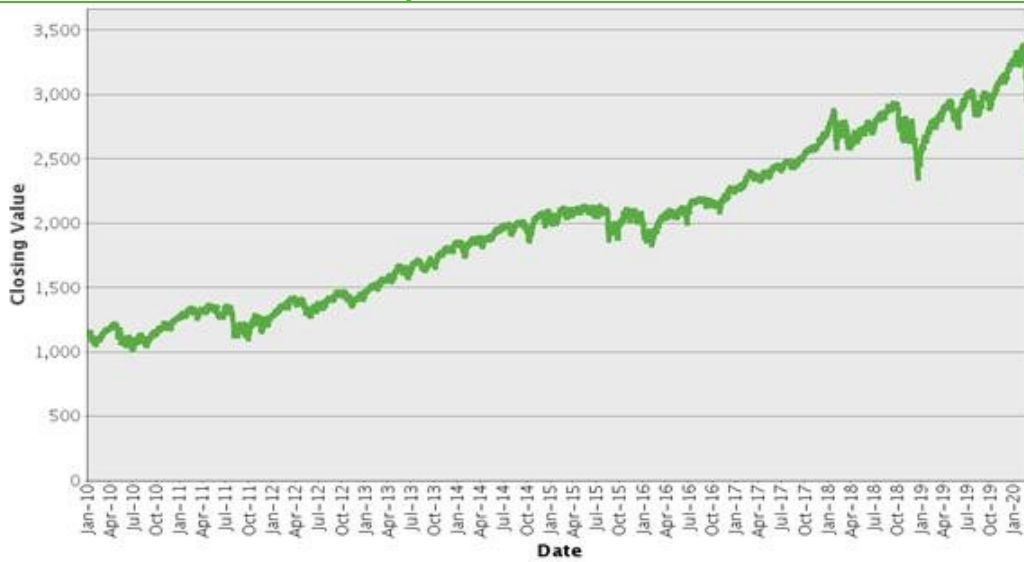
S&P 500® Index – Historical Closing Values January 4, 2010 to March 17, 2020

The graph below shows the closing value of the S&P 500® Index for each day such value was available from January 4, 2010 to March 17, 2020. We obtained the closing values from Bloomberg L.P., without independent verification. You should not take historical closing values as an indication of future performance.