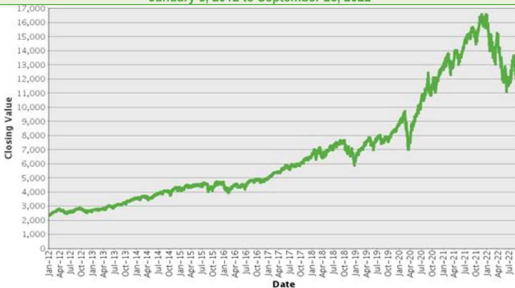
Nasdaq-100 Index® – Historical Closing Values January 3, 2012 to September 26, 2022

The graph below shows the closing value of the Nasdaq-100 Index® for each day such value was available from January 3, 2012 to September 26, 2022. We obtained the closing values from Bloomberg L.P., without independent verification. You should not take historical closing values as an indication of future performance.