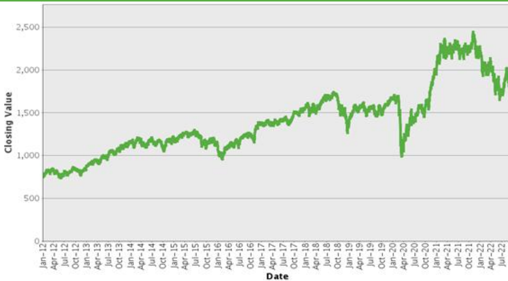
Russell 2000® Index – Historical Closing Values January 3, 2012 to September 26, 2022

The graph below shows the closing value of the Russell 2000® Index for each day such value was available from January 3, 2012 to September 26, 2022. We obtained the closing values from Bloomberg L.P., without independent verification. You should not take historical closing values as an indication of future performance.