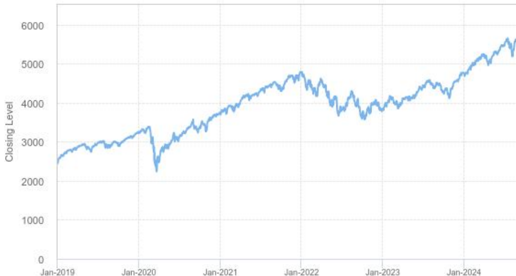
Historical Performance of the S&P 500 ® Index

The graph below shows the daily historical closing levels of the underlier from January 2, 2019 through September 18, 2024. We obtained the closing levels in the graph below from Bloomberg Financial Services, without independent verification.