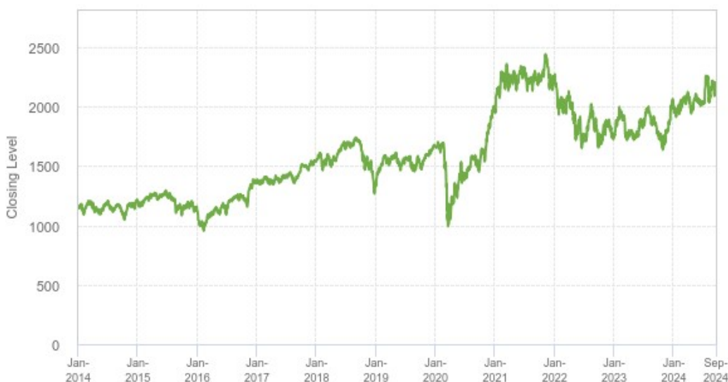
Historical Performance of the Market Measure

The graph below shows the daily historical closing levels of the Market Measure from January 1, 2014 through September 18, 2024. As a result, the following graph does not reflect the global financial crisis which began in 2008, which had a materially negative impact on the price of most equity securities and, as a result, the level of most equity indices. We obtained the closing levels in the graph below from Bloomberg Financial Services, without independent verification. On September 18, 2024, the closing level of the Market Measure was 2,206.336.