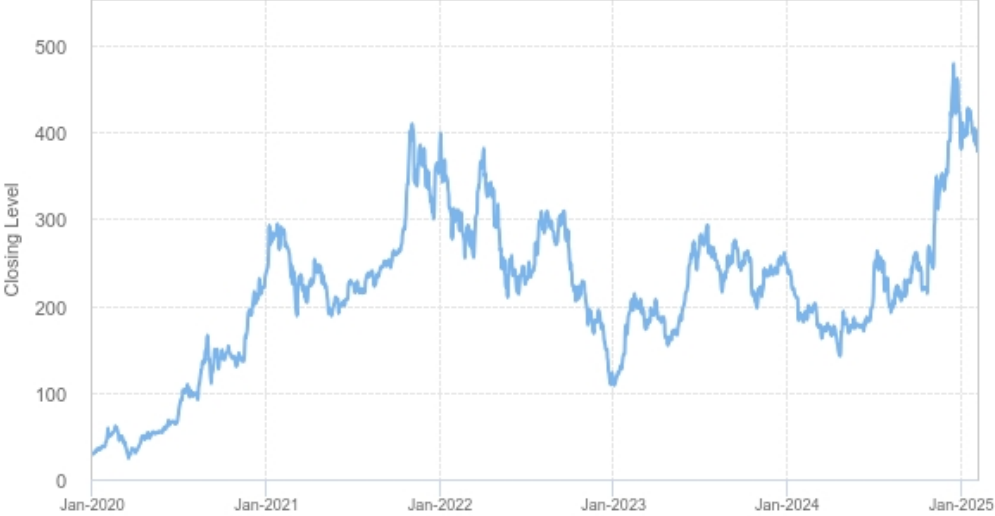
Historical Performance of Tesla, Inc.

According to publicly available information, Tesla, Inc. designs, develops, manufactures, sells and leases fully electric vehicles and energy generation and storage systems. Information filed with the SEC by the index stock issuer under the Exchange Act can be located by referencing its SEC file number 001-34756. The daily historical closing prices for Tesla, Inc. in the graph below have been adjusted for a 5-for-1 stock split that became effective before the market open on August 31, 2020 and a 3-for-1 stock split that became effective before the market open on August 25, 2022.