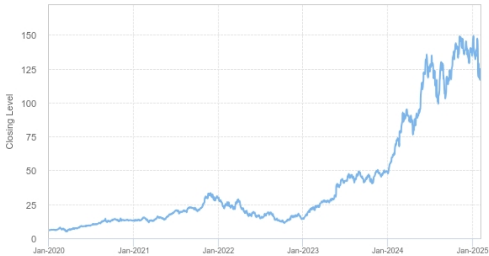
Historical Performance of NVIDIA Corporation

According to publicly available information, NVIDIA Corporation is a full-stack computing infrastructure company with data-center-scale offerings. Information filed with the SEC by the index stock issuer under the Exchange Act can be located by referencing its SEC file number 000-23985. The daily historical closing prices for NVIDIA Corporation in the graph below have been adjusted for a 4-for-1 stock split that became effective before the market open on July 20, 2021 and a 10-for-1 stock split that became effective before the market open on June 10, 2024.