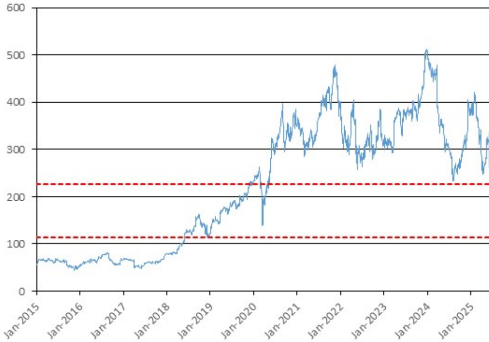
The Common Stock of lululemon athletica inc. – Daily Closing Prices January 1, 2015 to July 16, 2025

This document relates only to the securities offered hereby and does not relate to the underlying equity or other securities linked to the underlying equity. We have derived all disclosures contained in this document regarding the underlying equity from the publicly available documents described in the preceding paragraphs. In connection with the offering of the securities, neither we nor the agent has participated in the preparation of such documents or made any due diligence inquiry with respect to the underlying equity.