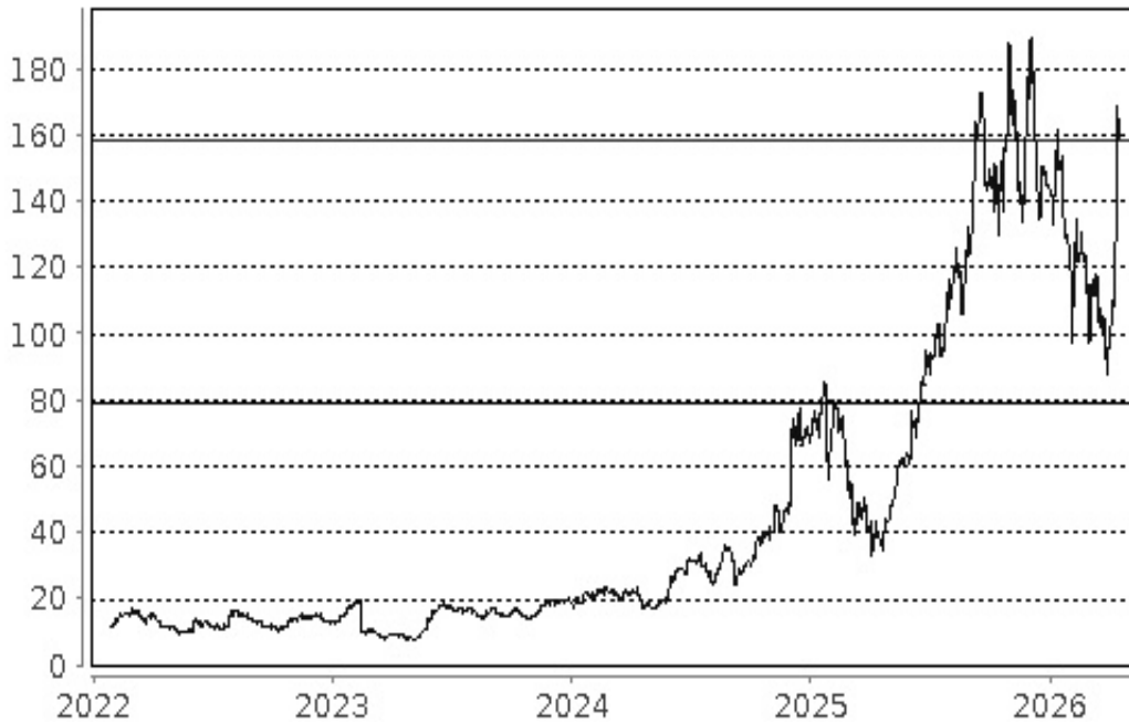
Historical Pricing Data from January 27, 2022 to April 17, 2026

The graph below illustrates the performance of Credo's ordinary shares for the period indicated, based on the daily closing levels as reported by Bloomberg, without independent verification. UBS has not conducted any independent review or due diligence of any publicly available information obtained from Bloomberg. The solid lines respectively represent the hypothetical call threshold level of $158.57, which is equal to 100.00% of an intraday level on April 17, 2026, and the coupon barrier and downside threshold of $79.29, which is equal to 50.00% of an intraday level on April 17, 2026. The actual call threshold level, coupon barrier and downside threshold will be determined on the strike date. Past performance of the underlying asset is not indicative of the future performance of the underlying asset during the term of the Notes.