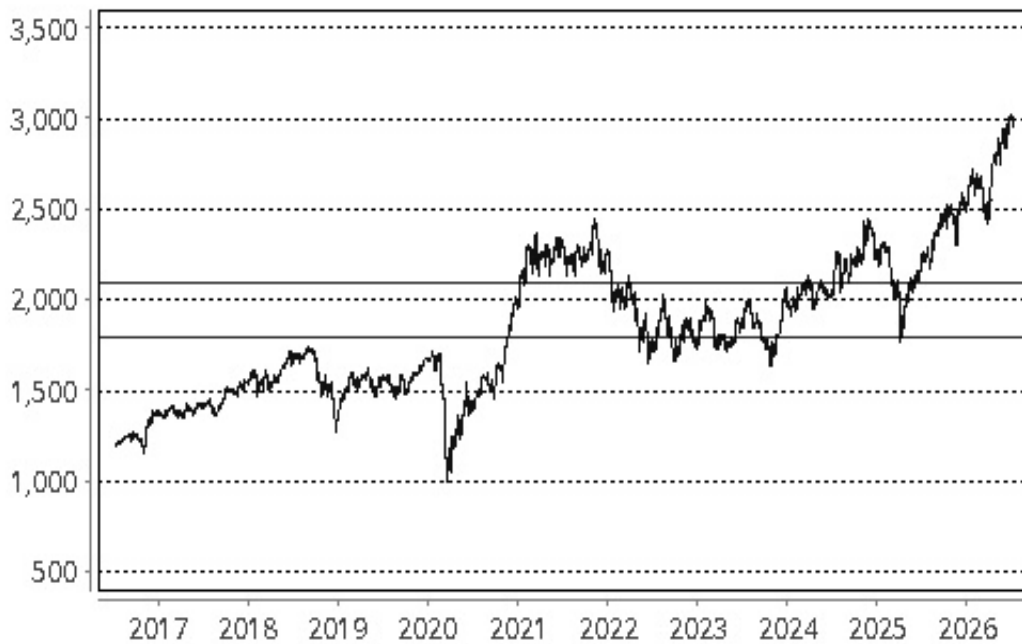
Historical Pricing Data from July 11, 2016 to July 9, 2026

The graph below illustrates the performance of the Russell 2000® Index for the period indicated, based on the daily closing levels as reported by Bloomberg, without independent verification. UBS has not conducted any independent review or due diligence of any publicly available information obtained from Bloomberg. The solid lines respectively represent its coupon barrier of 2,094.779, which is equal to 70.00% of the initial level and downside threshold of 1,795.525, which is equal to 60.00% of the initial level. Past performance of the underlying asset is not indicative of the future performance of the underlying asset during the term of the Notes.