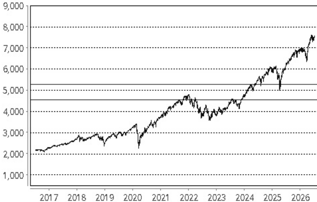
Historical Pricing Data from July 11, 2016 to July 9, 2026

The graph below illustrates the performance of the S&P 500® Index for the period indicated, based on the daily closing levels as reported by Bloomberg, without independent verification. UBS has not conducted any independent review or due diligence of any publicly available information obtained from Bloomberg. The solid lines respectively represent its coupon barrier of 5,280.55, which is equal to 70.00% of the initial level and downside threshold of 4,526.18, which is equal to 60.00% of the initial level. Past performance of the underlying asset is not indicative of the future performance of the underlying asset during the term of the Notes.