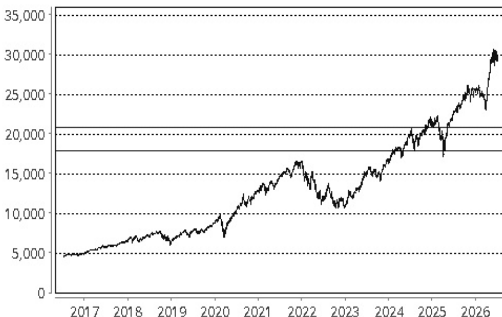
Historical Pricing Data from July 11, 2016 to July 9, 2026

The graph below illustrates the performance of the Nasdaq-100 Index® for the period indicated, based on the daily closing levels as reported by Bloomberg, without independent verification. UBS has not conducted any independent review or due diligence of any publicly available information obtained from Bloomberg. The solid lines respectively represent its coupon barrier of 20,808.97, which is equal to 70.00% of the initial level and downside threshold of 17,836.26, which is equal to 60.00% of the initial level. Past performance of the underlying asset is not indicative of the future performance of the underlying asset during the term of the Notes.